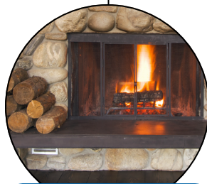
FIREPLACES AND FIREPLACE INSERTS

What heating equipment in my home can cause fires?